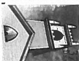
Paul Strand 1890-1978