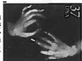
Alfred Stieglitz 1864-1946