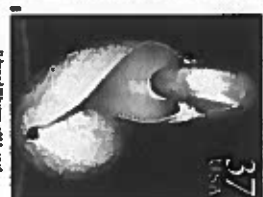
Edward Weston 1890-1958