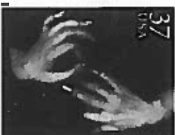
Alfred Stieglitz 1864-1946