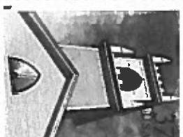
Paul Strand 1890-1976