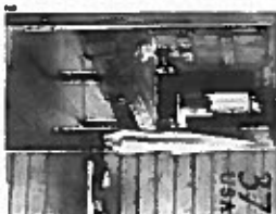
Walker Evans 1897-1975