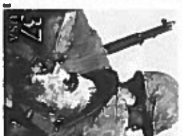
W. Eugene Smith 1918-1978