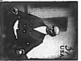
Sandwich 1811-1841 (1841-1841)