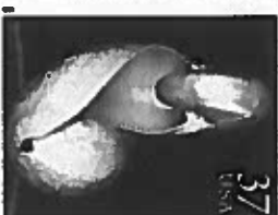
Edward Weston 1890-1958