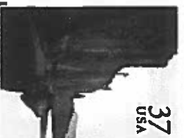
Carlson & Walker 1849-1916