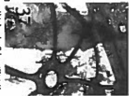
Alvin Langdon Coburn 1871-1944