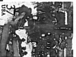
Timothy H. O'Sullivan 1844-1882