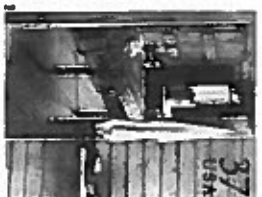
Walker Evans 1897-1975