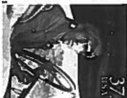
Dorothea Lange 1895-1978