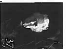
Imogen Cunningham 1897-1992