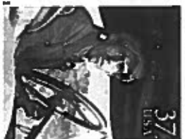
Dorothea Lange 1895-1965