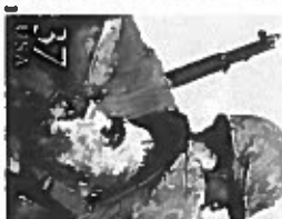
W. Eugene Smith 1918-1978